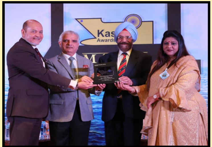
Kashti Vibhushan Award 2019 in the field of Human Welfare & Social Work .