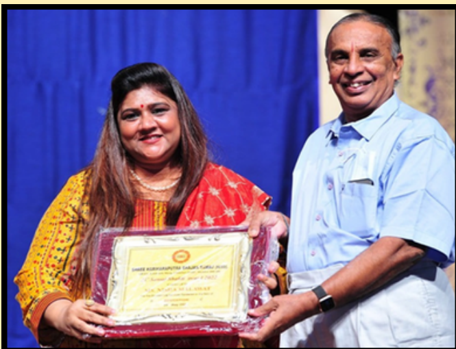
“Samajshakti Award 2022” for outstanding contribution in field of education.