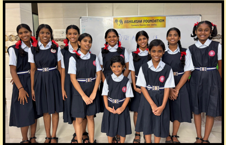
School is a Dream