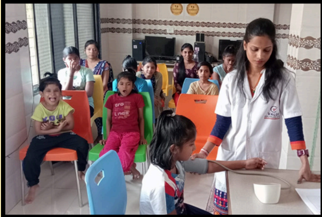
Regular Monthly Check-ups