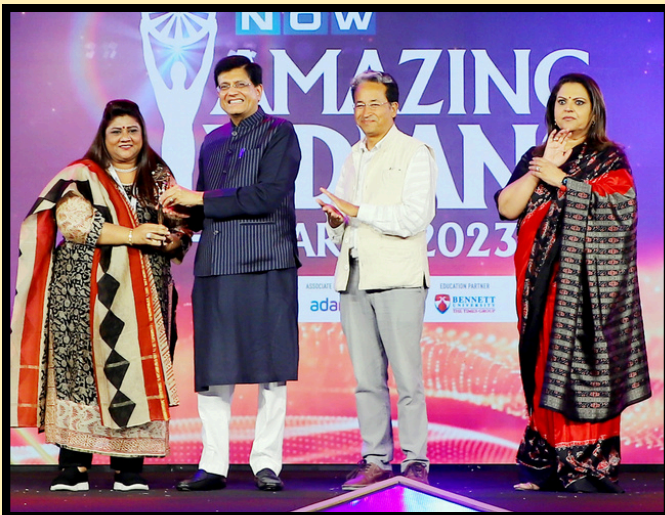
Won Times Now “Amazing Indians Award 2023” in “Slum Care” category for providing quality education to slum children.