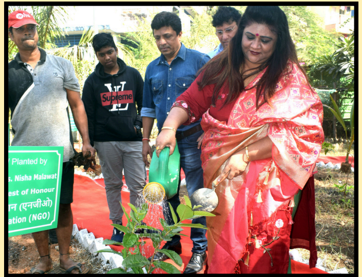
Environment Awareness Day