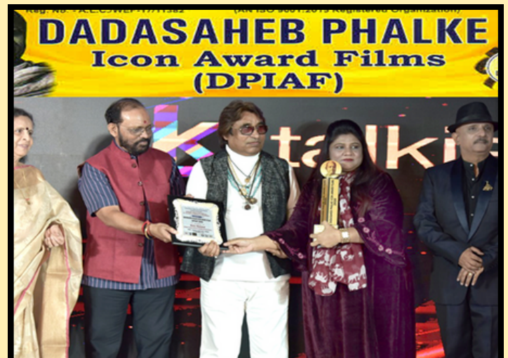
Dadasaheb Phalke Icon Award Films 2020, in “Social Service & Philanthropy for education.